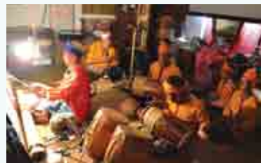
皮影戏大师：杨福成 Tok Dalang: Eyo Hock Seng