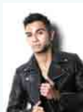
演唱 / Vocalist: Taufik Batisah (Artiste Networks)