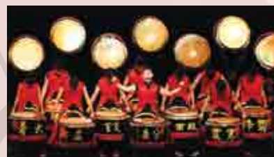
鼓: 惊鼓人打击乐团 Drum: ZingO Festival Drum Group